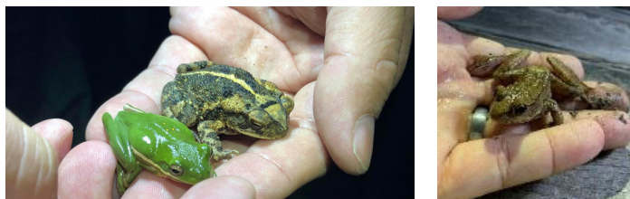
Green tree frog (left) and Gulf Coast toad (right) Bronze frog

Common amphibians at Burden include the green tree frog, Gulf Coast toad, and bronze frog. While all three species are more active in spring and summer, they can be found year-round in southern Louisiana. We found these handsome little guys in the Barton Arboretum on a warm, rainy winter night in December.