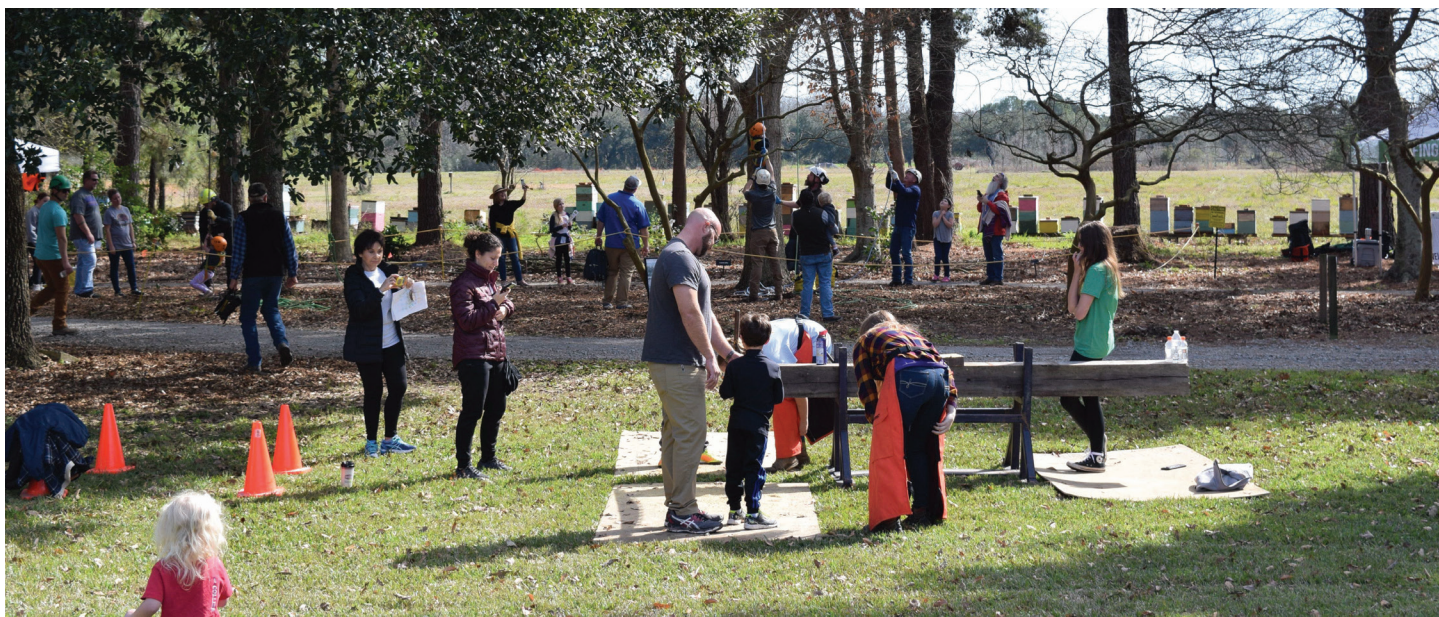
Arbor Day activities in full swing.